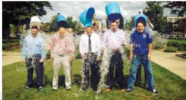
My colleagues, Erie officials and I participated in the ALS Ice Bucket Challenge to help raise awareness of Lou Gehrig's disease.

The maximum property tax or rent rebate for most qualifying Pennsylvania residents is $650.