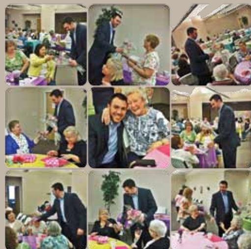
I had a great time meeting with the wonderful ladies at the Millcreek JOY Center.