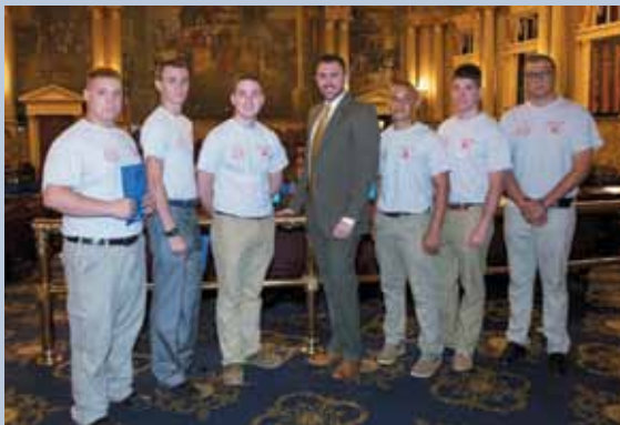
I was honored to spend some time in the House chamber with Keystone Boys State participants.

I was proud to take part in the annual Highmark's Walk for a Healthy Community at Presque Isle State Park.