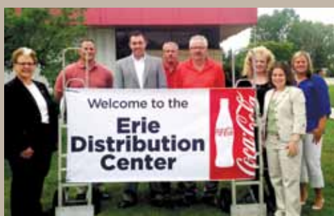
I had the privilege of touring the local Coca-Cola distribution center to see how the facility operates.