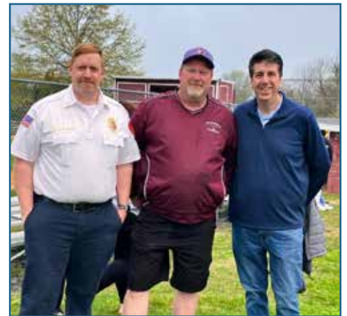
It was another great opening day for the Pottsgrove-Pottstown Little League, and I was honored to be asked to sing the National Anthem.