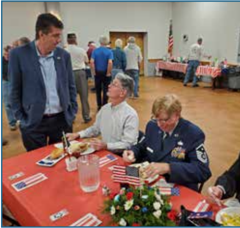
Our veterans' lunch, held each year on Pearl Harbor Day, continues to be one of my favorite events!