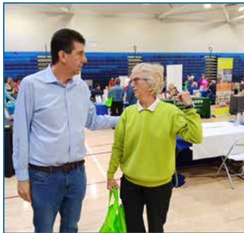
We had more than 200 seniors attend our Senior Fair, where they were able to pick up useful info on everything from their health to finances to personal safety.