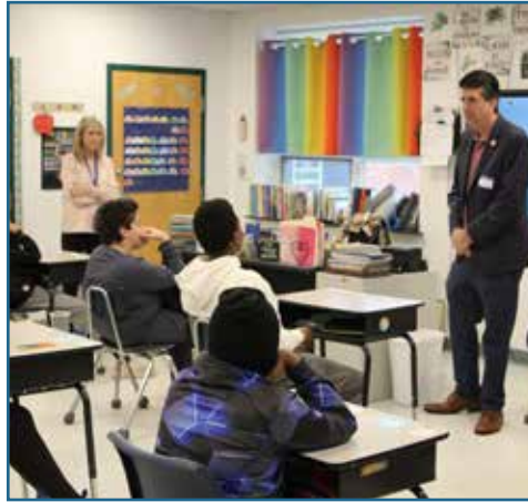
Going into local schools to talk to students is one of my favorite parts of the job.