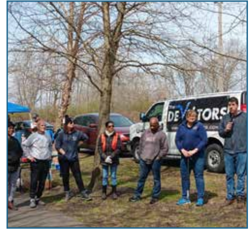
More than 50 community members pitched in to remove trash from an abandoned encampment near MCCC in Pottstown.