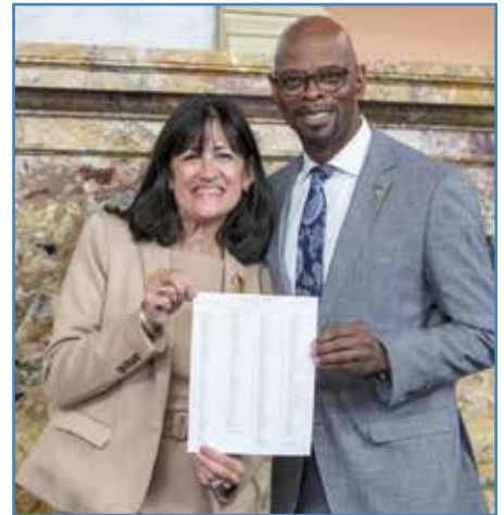
Here I am with Rep. Cooper holding the official House vote on our bill.

H.B. 1258 (Act 52 of 2023): will improve the funding mechanism for dual enrollment programs by removing the requirement that students enrolled in such programs are removed from the school's average daily membership. Commonly referred to as the "ADM," the average daily membership impacts state funding to local school districts. Dual enrollment programs allow high school students to enroll in college-level classes, earning college credits while still enrolled in high school. In some cases, college classes are taught by certified high school teachers and in the high school facility. I joined Rep. Jill Cooper to introduce this bill.