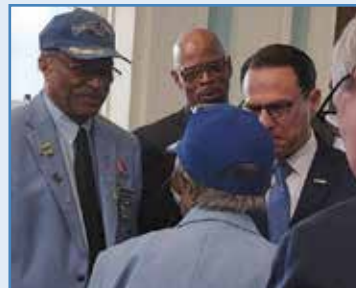
On March 29, 2023, I joined Gov. Shapiro, former Mayor Jim Kenney and multiple House colleagues to celebrate the inaugural "Tuskegee Airman Commemoration Day" in Pennsylvania.

The Tuskegee Airmen were the first group of African American military aviators, who fought during World War II. Despite facing rigid racial barriers and constant segregation, these airmen were among the most accomplished and effective pilots of the entire war. Upwards of 900 pilots who graduated from Tuskegee Airfield flew 1,578 missions and 15,533 sorties, destroying 261 enemy aircraft and earning themselves more than 850 medals, collectively. In 2022, I was proud to help pass legislation (H.B. 2586) that now recognizes March 29 every year as "Tuskegee Airman Commemoration Day" in Pennsylvania. It's very important that we continue honoring and recognizing these incredible men and women for their sacrifice to protect our country while facing horrific forms of oppression.