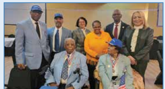
I hosted a Veterans' Day luncheon that took place at Treasures Banquet Hall honoring the Tuskegee Airmen and local veterans.