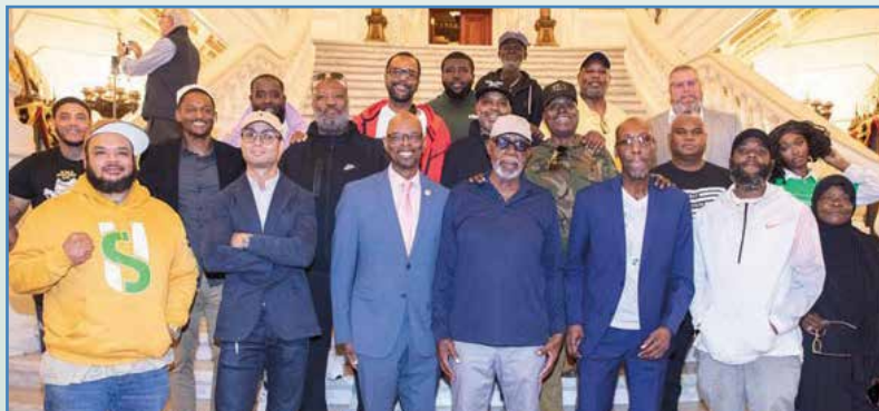
I joined prison reform advocates to celebrate movement on this bill the day it was reported out of the House Judiciary Committee.

H.B. 462: would outlaw the use of the standard chokehold in making an arrest as well as any action that inhibits breath or the flow of blood to the brain due to physical position.