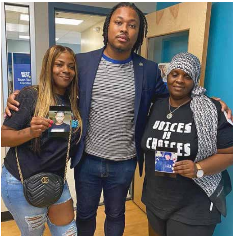
Rep. Kenyatta with activists at a community discussion at the Columbia North YMCA about disrupting gun violence.