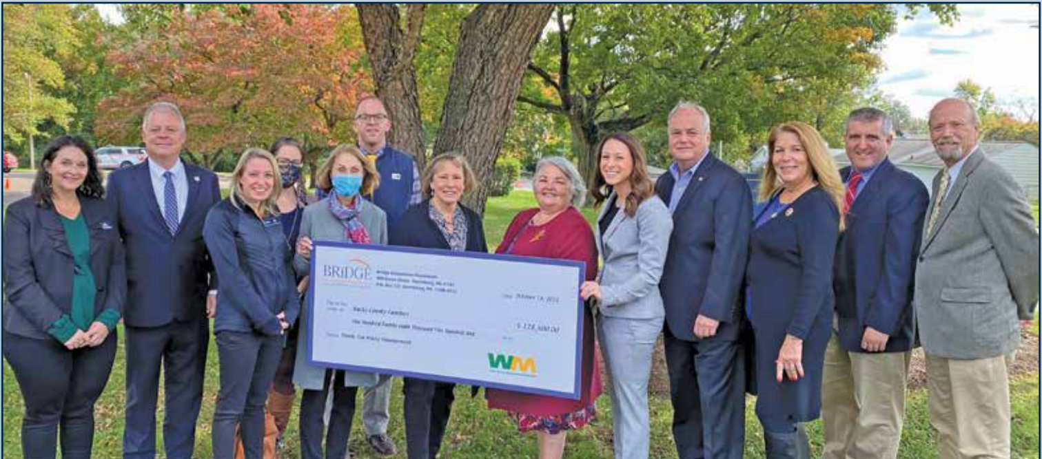
BRIDGE EDUCATION FOUNDATION AND WASTE MANAGEMENT PRESENT $124,000 IN EDUCATIONAL SCHOLARSHIPS TO BUCKS COUNTY FAMILIES.