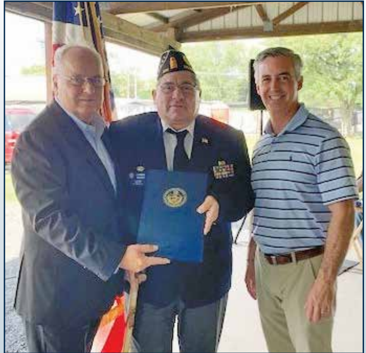
75TH ANNIVERSARY OF AMERICAN LEGION POST 834