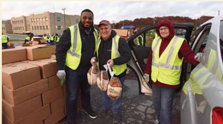
I teamed up with community partners to give away 400 free turkeys to Mon Valley families for Thanksgiving.