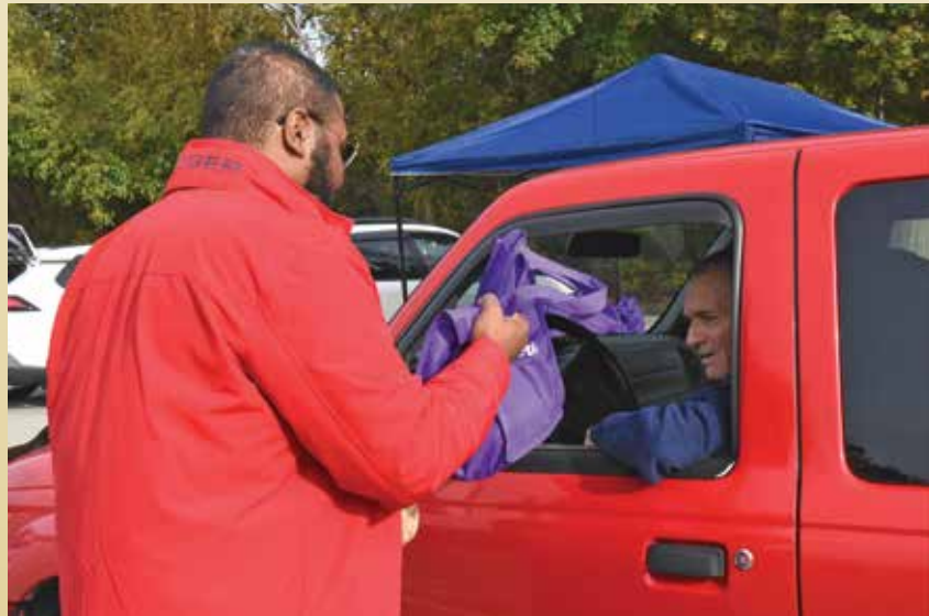
It was great to reconnect with folks who came out to my Drive-Thru Senior Fair in October. They were able to collect information on resources, drop off medications for safe disposal and take advantage of a flu shot provided by UPMC.