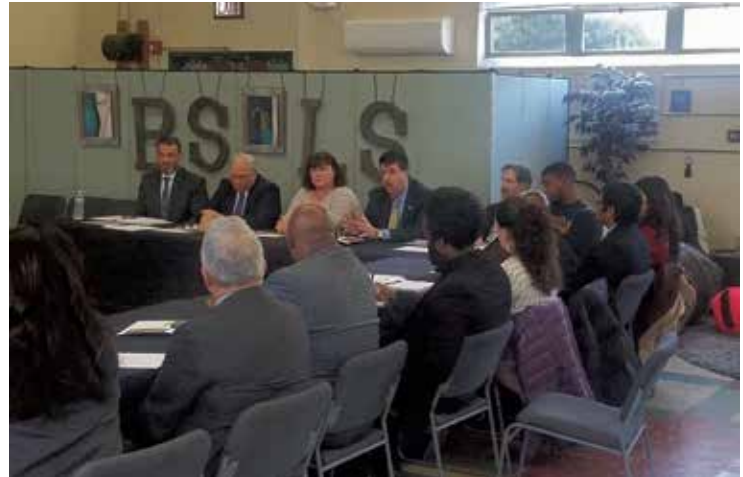
Pre-pandemic, I discussed fair funding and charter school reform at an education roundtable with Education Secretary Pedro Rivera (far left) at Pottstown School District.

These funding reforms are accomplished through applying the same special education funding formula that school districts use to charter schools, requiring the use of actual instead of budgeted expenditures in tuition rate calculations, and enacting a data-based statewide cyber charter tuition rate, which can currently vary from $7,700 to $21,400 per student even at the same cyber charter school. By focusing on commonsense reforms that fix what's wrong with our charter school law, I'm proud of the bipartisan support my bill has attracted and look forward to continuing to push for it.