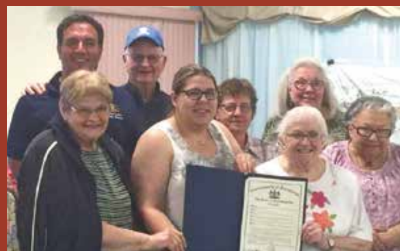
Rep. Burns presented a House citation to the Ebensburg Senior Center in conjunction with Older Pennsylvanians Month.

Whether it's helping them pay for prescription drugs, making sure they aren't taken advantage of, or ensuring that after a lifetime of working they can take a public bus to a favorite restaurant or shopping destination, Rep. Burns is always ready to assist seniors.