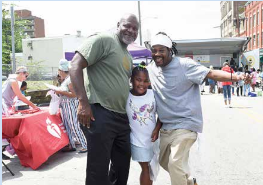
Having fun and getting fit at our August Health Fair!