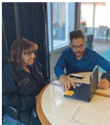
Helping our district's seniors obtain their ConnectCards.