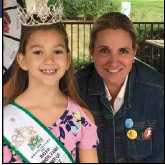
2019's Little Miss Agriculture Representative at my Fall Harvest Festival.