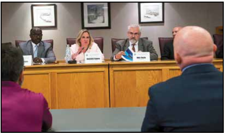
Area legislators joined me at my recent policy hearing on stormwater management and infrastructure.