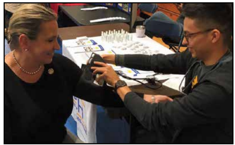
Free health screenings were provided at my October Senior Expo at Kennett Middle School.

I support House Bill 1475, which proposes a study on the economic benefit of conservation corridors. These corridors would provide designated open space to protect wildlife and create recreational opportunities. Pennsylvania is a leader among states for outdoor recreational activity and related consumer spending. Continued development has encroached on safe habitats for many native species. Providing Pennsylvania wildlife protection and supporting ecotourism is a win for us all.