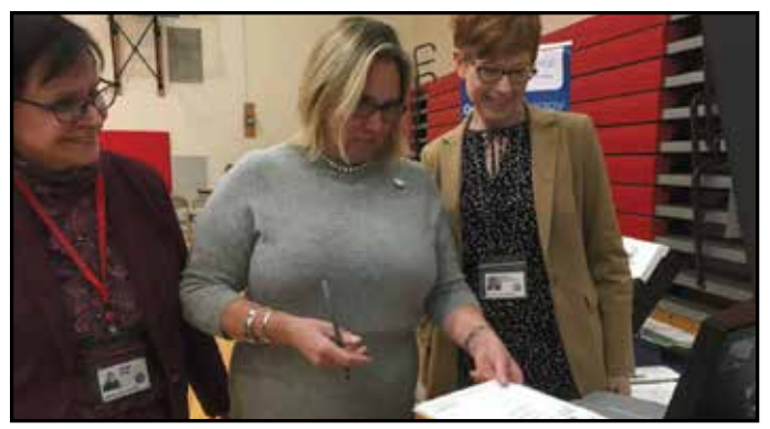
The county's new voting machines were on display at my West Chester Senior Expo.

I was pleased to vote in favor of Pennsylvania's most significant improvements to our elections in the last 80 years. Act 77 of 2019 creates a new option to vote by mail up to 50 days before an election, extends the deadline to register to vote by 15 days and helps pay for safer, more secure voting systems with a paper trail. This legislation will take effect for the April 2020 primary election. My office can help answer any questions on the new voting laws.