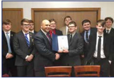
Honoring the young men of the Order of DeMolay's Erie Chapter.