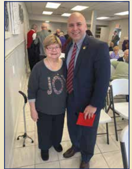
Above: At the new JOY Senior Center ribbon cutting.