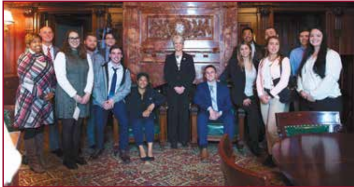
I was honored to welcome West Chester University students to the Capitol so they could see legislative processes firsthand.

Throughout the semester, I discussed with students top issues facing the legislature, such as voting reform, property tax reform, liquor privatization, recreational marijuana, and much more.