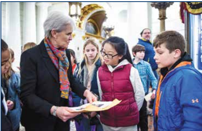
Westtown-Thornbury Elementary School students enjoyed a fun and informative day at our commonwealth's Capitol.

I was pleased to welcome several classes of students to the Capitol this year. Students from elementary school to college are welcome to visit the Capitol. Please contact my office if you're interested in arranging a field trip!