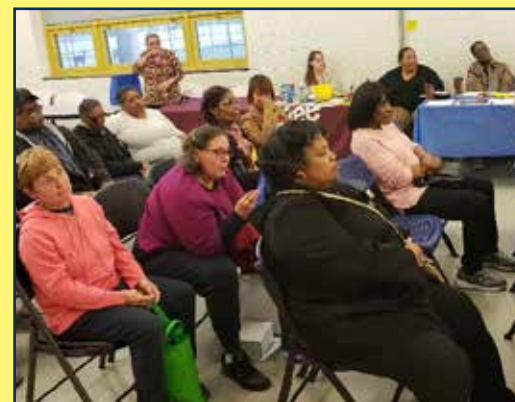
It was a pleasure to meet with my constituents and hear their concerns at our 61st Ward Town Hall!