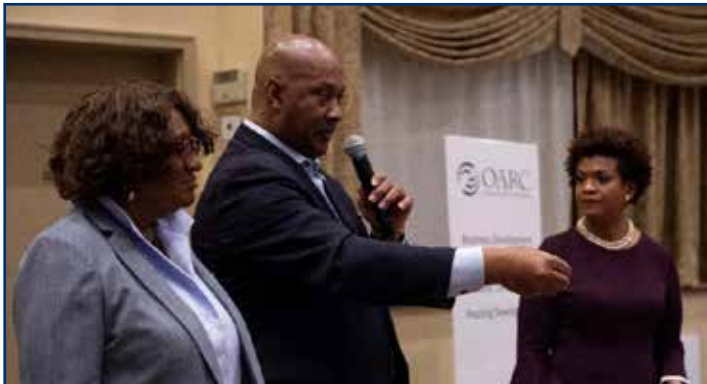
Congressman Dwight Evans was the Keynote Speaker of our Economic Empowerment Business Summit.