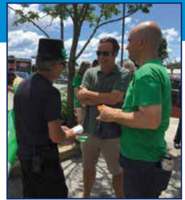
Don't let my last name fool you! My family lines are overwhelmingly Irish, which is why I was especially happy at the 3rd Annual Havertown Irish Festival.