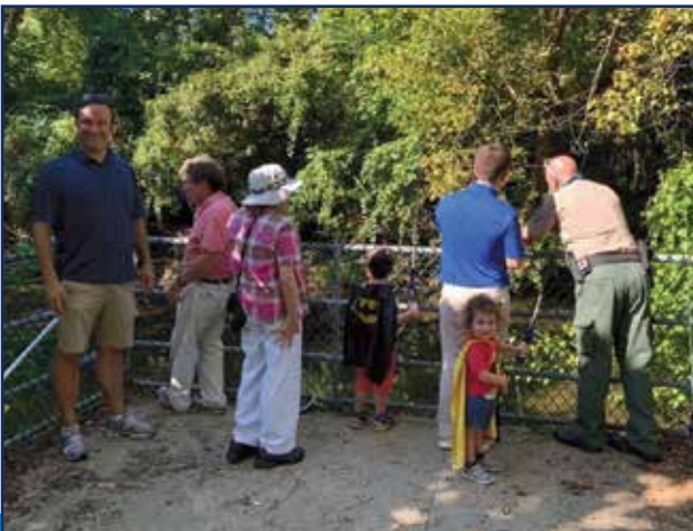
This fall, we were able to teach folks how to fish while also learning about the various species of fish in area waters like Darby Creek.