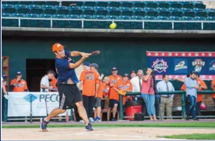
Participating in the Capitol All-Star Softball game was a BLAST, and it helped raise money to help fight hunger in Pennsylvania.