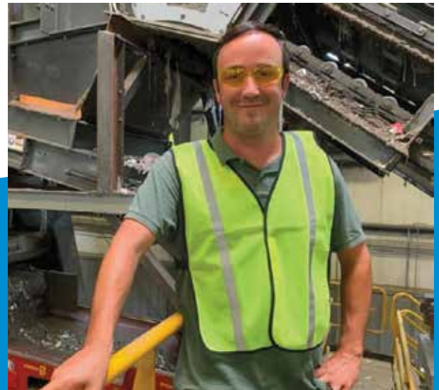
Right: I had the chance to tour Penn Waste's recycling facility in York to see how single stream recycling is processed and learn more about the challenges we face with recycling today.