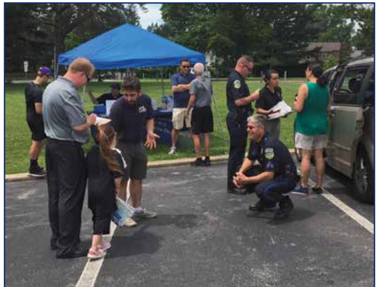
A special thanks to the Upper Darby Police Department and PA State Police for helping out during our Car Seat Safety Check.