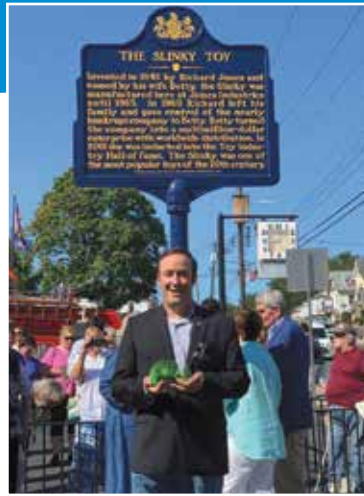
Did you know the Slinky was born in Clifton Heights? What better way to celebrate National Slinky Day!