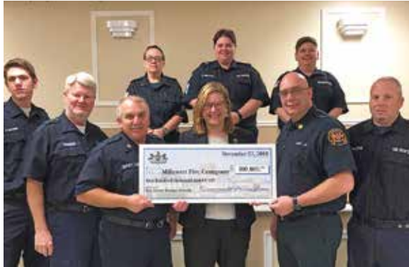
The Milmont Fire Company was awarded $100,000 in state funds for building improvements. I'm pleased to support the first responders who serve our communities!