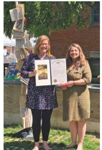
Swarthmore Library celebrated its 90th birthday in the spring!