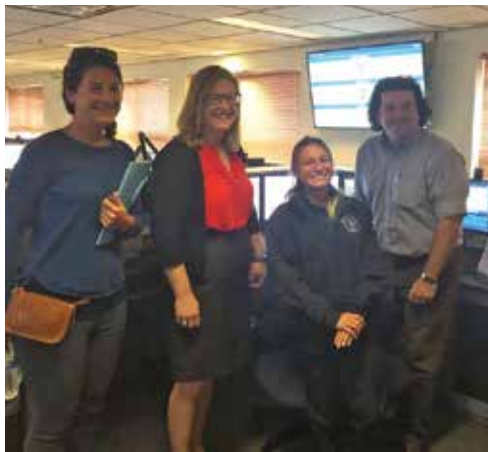
I took a tour of Delaware County Emergency Services' 911 center and learned more about what happens behind the scenes when someone calls 911. I'm grateful to the first responders who keep us safe.