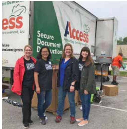
My staff and I were happy to help constituents at our spring shredding event!