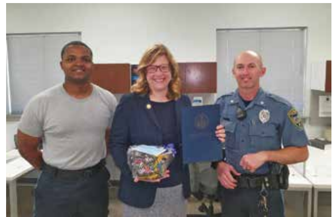
My staff and I visited local police departments to drop off treats to say thank you during National Police Week in May.