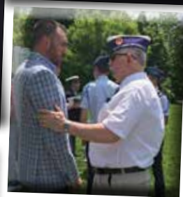
Over Memorial Day weekend, I spoke with our area's amazing veterans while attending a ceremony for the dedication of a plaque honoring Erie County soldiers who died in WWI.