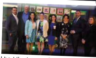
I had the honor of attending a tower-lighting ceremony held by UPMC-Hamot and the Center for Organ Recovery and Education.