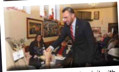
It's always a pleasure to visit with area veterans at the Elks Lodge #67.