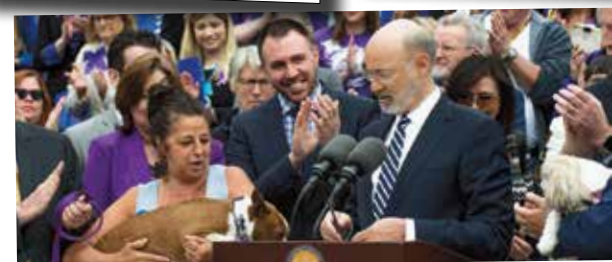
It was an honor to stand with Gov. Tom Wolf and area animal advocates at Humane Lobby Day 2019.