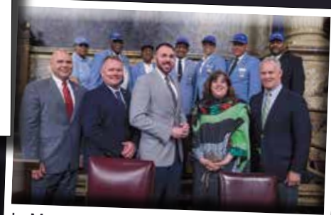
In May, we honored the famed Tuskegee Airmen, who flew missions with tremendous skill in WWII, as the House adopted a resolution designating May 8 as Tuskegee Airmen Day in Pennsylvania.