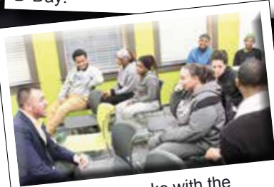
In February, I spoke with the students of the Youth Leadership Institute about public service, state government and the future of Erie.