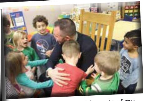
One of the more enjoyable parts of my job is reading to school students!