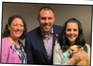
I thoroughly enjoyed participating in the United By Animals Humane Law Forum & Pet Expo, hosted by the Erie Humane Society.