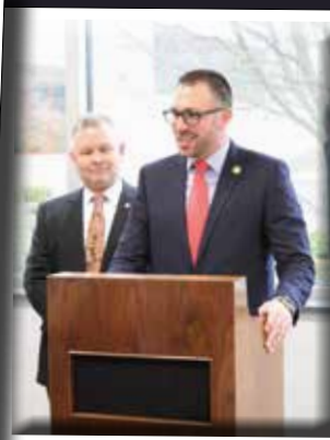
I was honored to be part of the ceremony at the LECOM dental offices as they were dedicated to our late, great colleague, Rep. "Flo" Fabrizio.