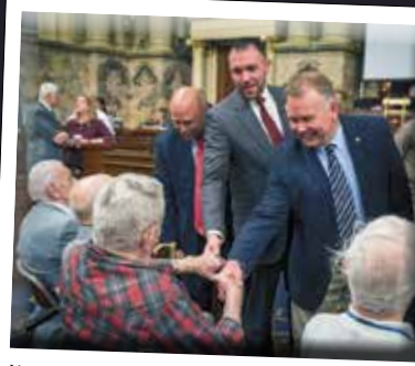
It was an honor to meet, thank and celebrate WWII heroes at the state Capitol on the 75th anniversary of D-Day!