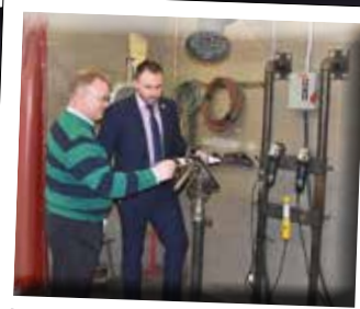
I had the chance to learn more about apprenticeships that benefit local job seekers.