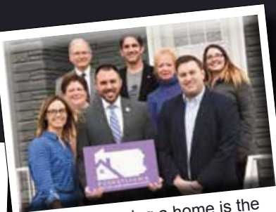
For many, owning a home is the American Dream. I co-authored legislation that would create a Pennsylvania First-Time Home Buyer Savings Account to help people do that.