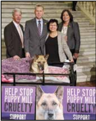
Left: Proud to stand with fellow legislators in support of Victoria's Law to better protect animals.