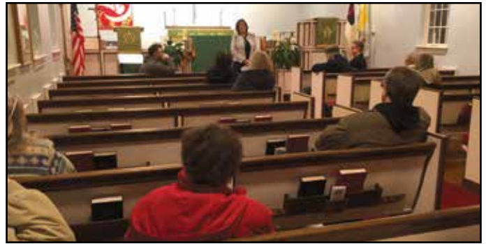
Right: Speaking at the Kaywin Neighborhood Block Watch Meeting.