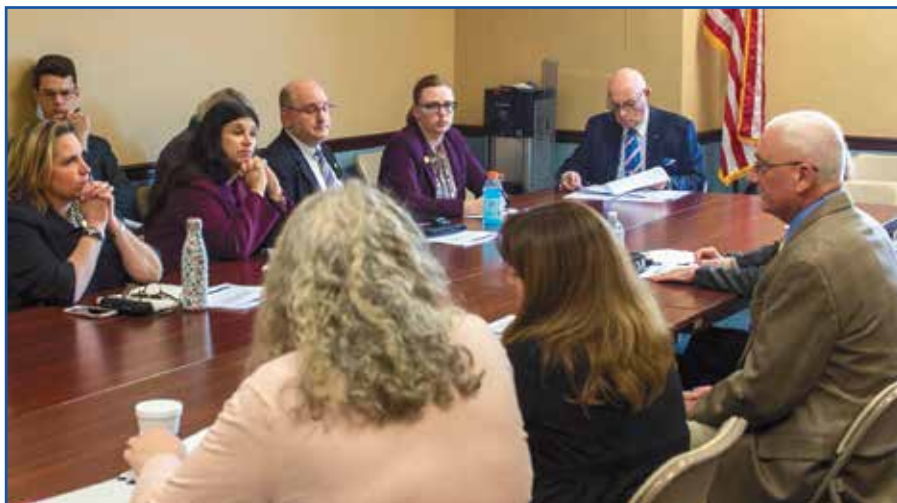
Attending the first meeting of the Mental Health Caucus.