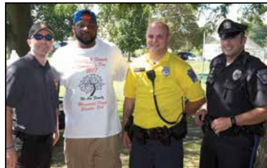
Family and Friends Community Day, Sept. 16, 2017 at Memorial Park in Chester