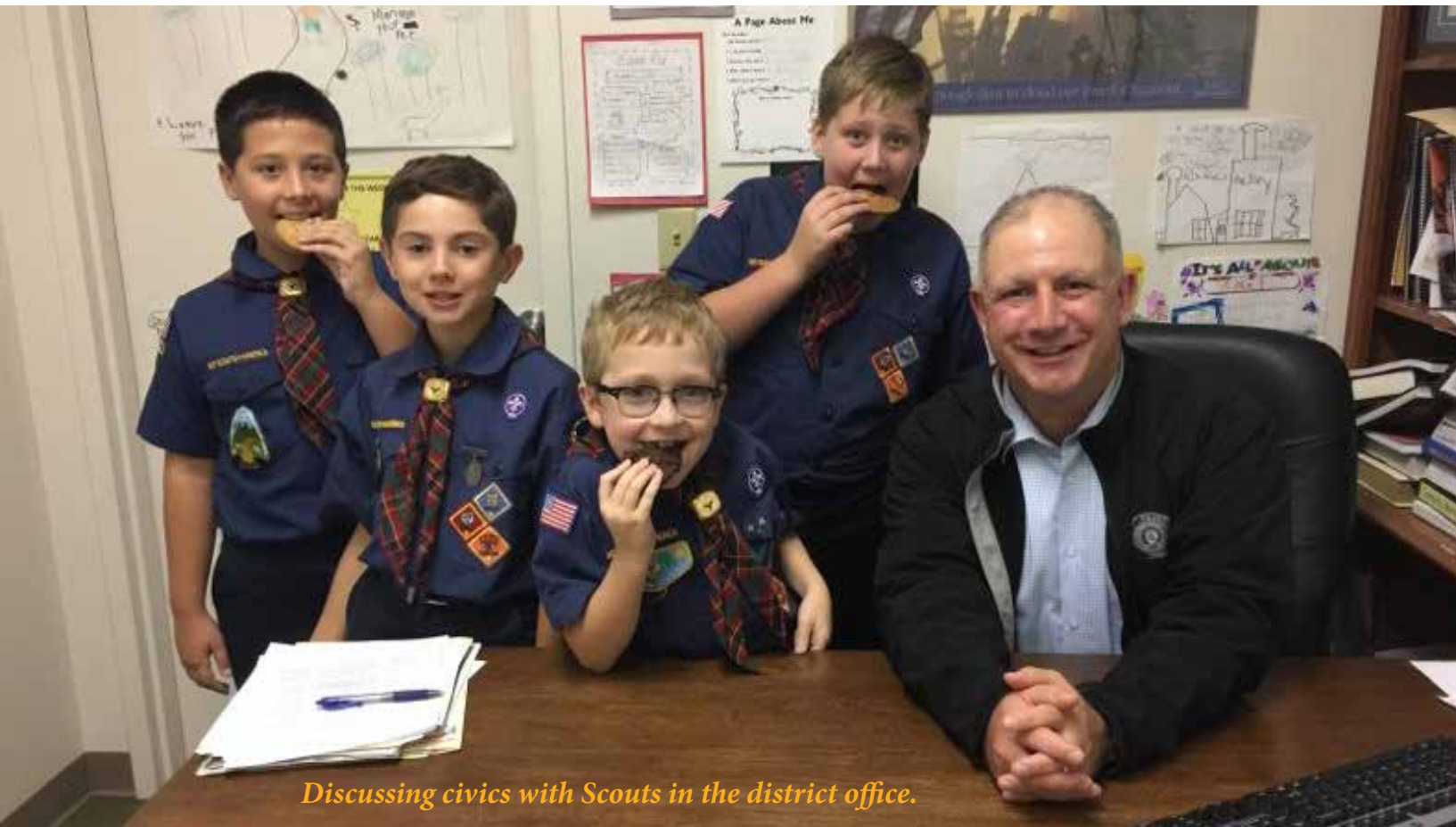
Discussing civics with Scouts in the district office.

Mt. Lebanon, Dormont, Castle Shannon, and Baldwin Township with parts of Scott Township and Brookline