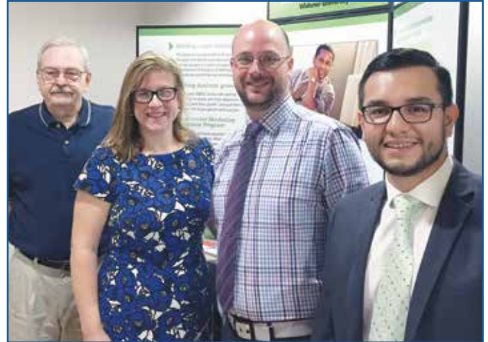
Prior to our Small Business Development Breakfast, I was able to visit with the Small Business Development Center at Widener University.