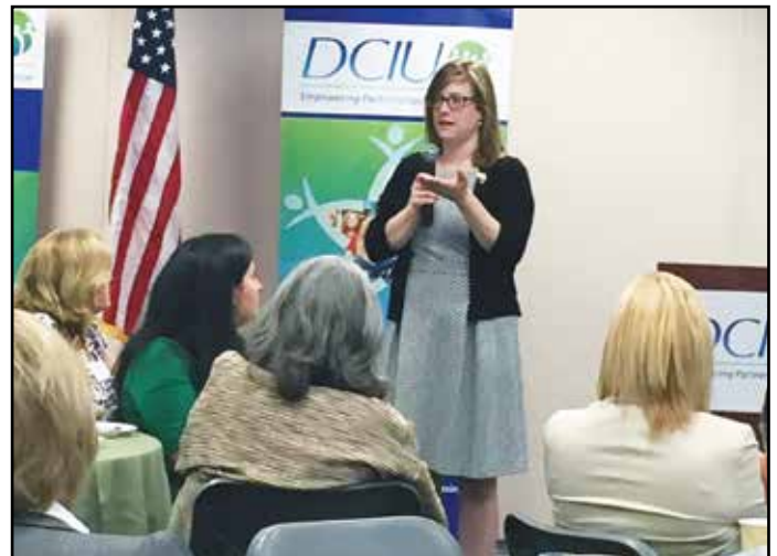
I had a great time speaking at the Delaware County Intermediate Unit Legislative Breakfast this spring.