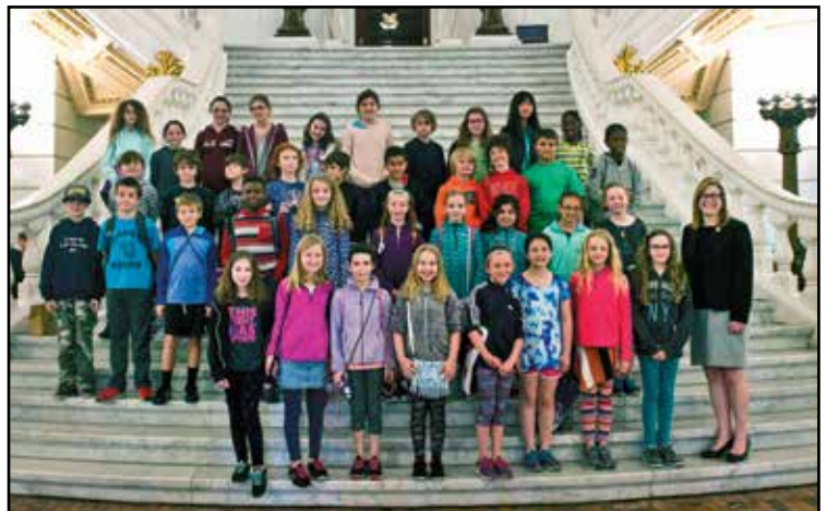
It was an honor to take the students of Swarthmore-Rutledge School on a tour of the Capitol!