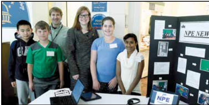
Few things make me as proud as seeing our students come to Harrisburg to showcase their work. In June, Nether Providence Elementary School students came to the Capitol to highlight their Nether Providence News work.