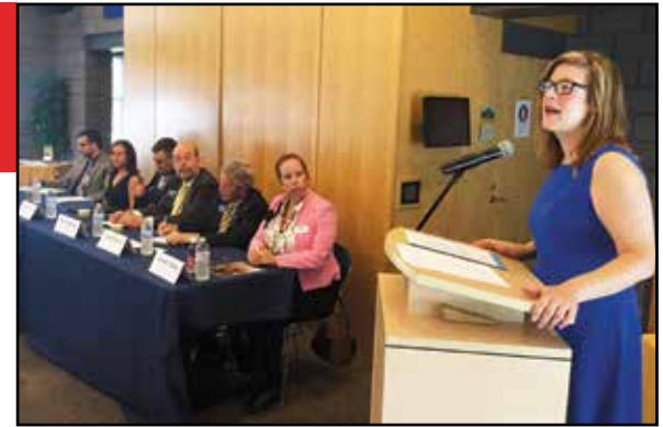
Thanks to the presenters and business owners who joined our Small Business Development Breakfast in July!

I hope the local business owners that joined us found the panel discussion and opportunity to learn more about the services available to them helpful. They truly are the backbone of our community and supporting them creates positive economic growth and good jobs for our community. If any small-business owners have questions about how my office can help, I encourage them to call us at 610-534-6880.