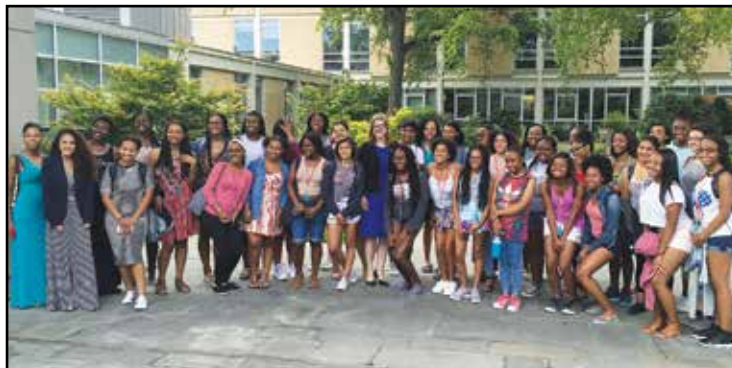
I had a great time speaking with young women at the Well Leadership Conference at Swarthmore College.

For more information on Safe Harbor for minors, please visit https://apps.health.pa.gov/PASafeHarbor or call (877) PA-HEALTH.