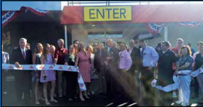
My staff was on hand to take part in the grand opening of a new ShopRite in our district.