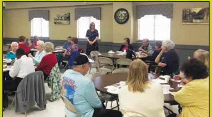
I look forward to visiting with seniors around the district again this fall!