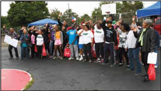
Constituents dance and celebrate during Rep. Wheatley’s Community Appreciation Day.

For more information about Health and Wellness Weekend, sign up to receive my emails at my website at www.pahouse.com/Wheatley or follow me on Facebook at www.facebook.com/RepWheatley or on Twitter at www.Twitter.com/RepWheatley .