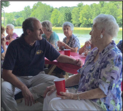
I enjoyed talking with constituents at the Unity Township senior picnic.