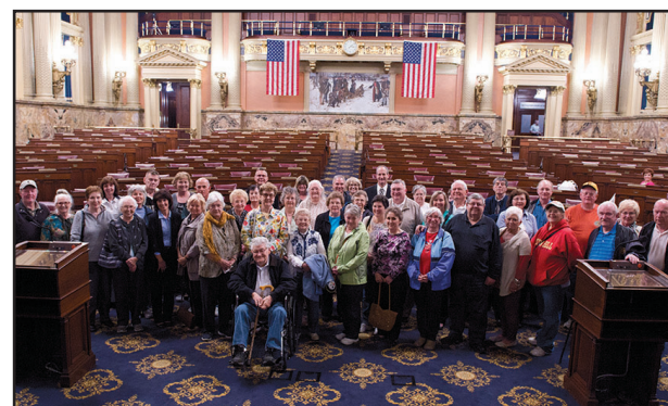
We had a great crowd on my recent bus trip to the Capitol.

If you are selected for jury duty and do not wish to serve because you are 75 or older, you may note that in the appropriate section of the jury questionnaire.