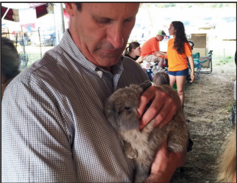
It’s always fun to visit the Derry Township Agricultural Fair. The committee did a marvelous job and this is a wonderful community event.