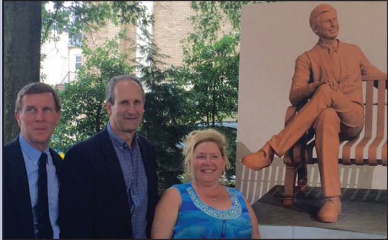
Wonderful times in Latrobe with my friends at the VFD serving pierogies again this year and at the Fred Rogers commemoration.