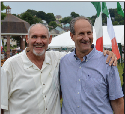
Despite some rain, the Festa Italiana di Vandergrift was a great time as always.