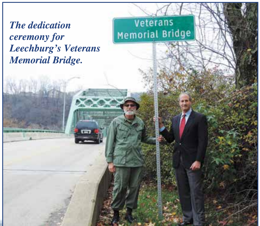
The dedication ceremony for Leechburg's Veterans Memorial Bridge.

Naming these bridges in honor of our hometown heroes is a way for the communities and the state to recognize the men and women, past, present and future, for their service to our country.