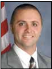
DANIEL DEASY State Representative 27th District

Southwest Office 301 Fifth Avenue, Suite 240 Pittsburgh, PA 15222 (412) 565-5700