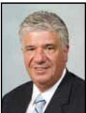
WAYNE FONTANA State Senator 42nd District

District Office 436 South Main Street, Suite 100 Pittsburgh, PA 15220 (412) 928-9514