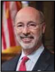
TOM WOLF Governor