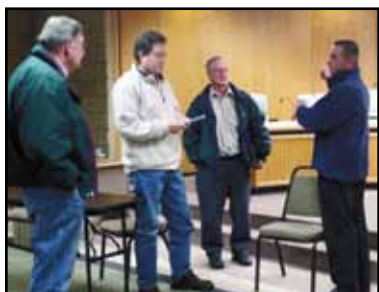
Rep. Deasy discusses issues regarding the Parkway West with Green Tree Borough officials.