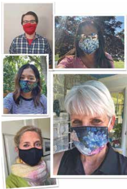
My district office staff and I #SmileBehindOurMasks.