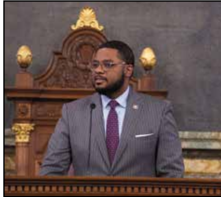
While in Harrisburg, I joined my colleagues in the Legislative Black Caucus to take control of the Speaker's rostrum in an effort to get important police reform legislation on the House calendar in the wake of the George Floyd killing.