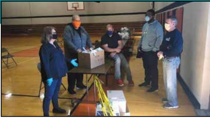
During these unprecedented times, I joined community leaders in Duquesne and Clairton to distribute food to families.