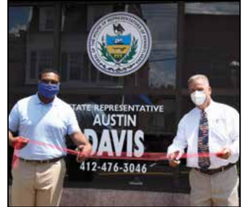
I recently moved offices in Munhall. My new Munhall office is located at 3905 Main St.