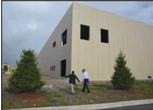
Pure Penn is expanding its medical marijuana facility in McKeesport, and I was able to get an up-close look at its expansion project. Since the legalization of medical marijuana in Pennsylvania, this industry continues to thrive, and Pure Penn is expanding its footprint right here in the Mon Valley.