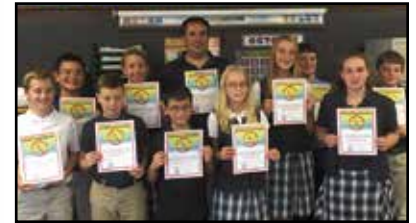
All Saints 6th-graders