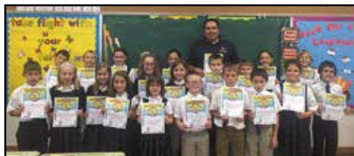
St. Benedict 3rd- and 4th-graders