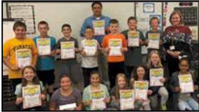
Central Cambria Elementary