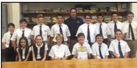
St. Benedict 7th- and 8th-graders