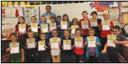
Central Cambria Elementary