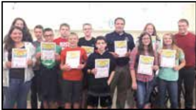
St. Michael 8th-graders