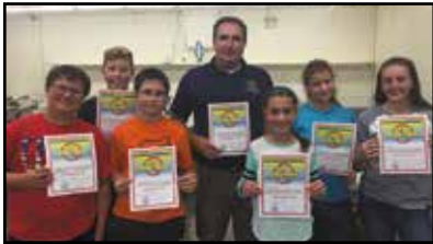
St. Michael 7th-graders