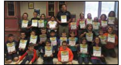
Cambria Heights 5th-graders