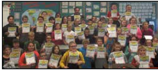
Jackson Township Elementary