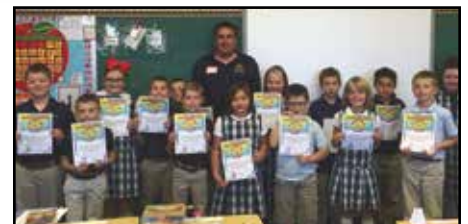
All Saints 4th-graders

“I believe education is a shared responsibility between parents students, teachers and government. We all have a responsibility to the next generation to provide a quality education without fear of being bullied.”