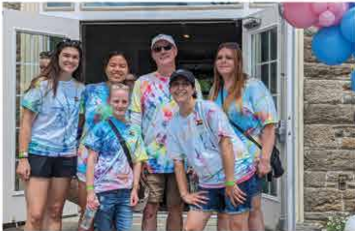
My team and I helped to set up and greet for Montco PRIDE Fest.

will also include road widening and new storm water drainage and management facilities. More information on the project as well as any updates can be found online at penndot.pa.gov .