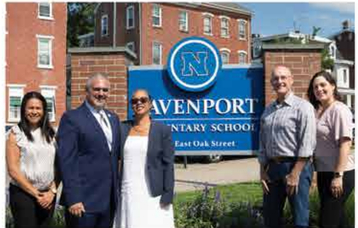
I joined Norristown School District and elected officials in school renaming ceremonies.