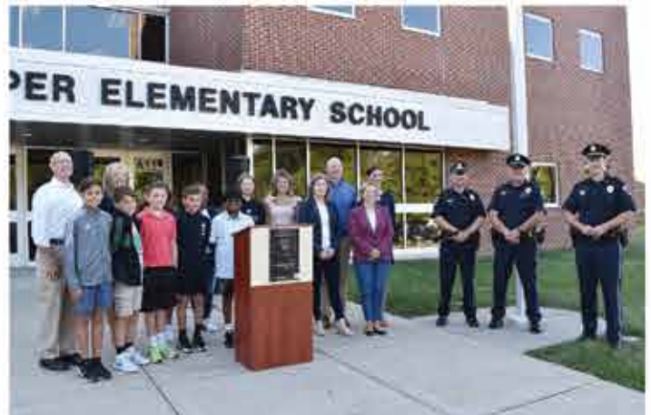
I donated POW/MIA flags to the Methacton School District and joined my colleagues, Lower Providence Police, and school students for a flag raising ceremony.