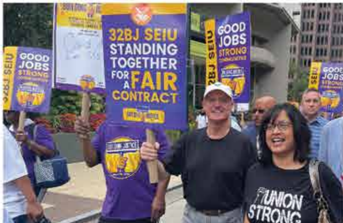
Joined my colleagues for many of the pro-union protests this summer and fall, walking in support of our union families and all those who would benefit from joining a union.