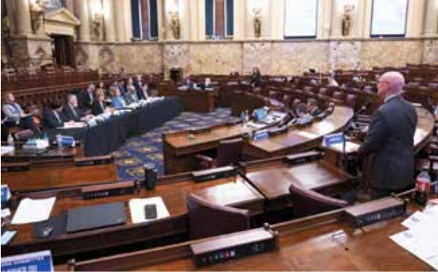
As a member of the House Appropriations Committee, I participated in multiple weeks of budget hearings with my colleagues and the Governor's administration.

Serving Collegeville, Upper and Lower Providence, West Norriton and Trappe