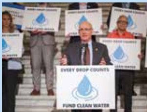
In honor of Clean Water Day I spoke about my Riparian Buffer Bill, HB 1275, in Harrisburg with PennFuture, Choose Clean Water Coalition, and the Coalition for the Delaware River.

On July 18, the Montgomery County Commissioners approved a contract with Herbert, Rowland, and Grubic Inc. to conduct the analysis of flooding incidents throughout the Perkiomen Creek watershed and propose mitigation projects to reduce the threat of loss of life, property damage, and disruption of essential services. The study will be completed by the end of summer 2025 and will suggest mitigation strategies throughout the watershed. The first public meeting to share details is planned for November 12, 2024, at the Upper Providence Township Building beginning at 6 PM. Additional public meetings are being planned for the Upper Perkiomen and East Branch areas as well.