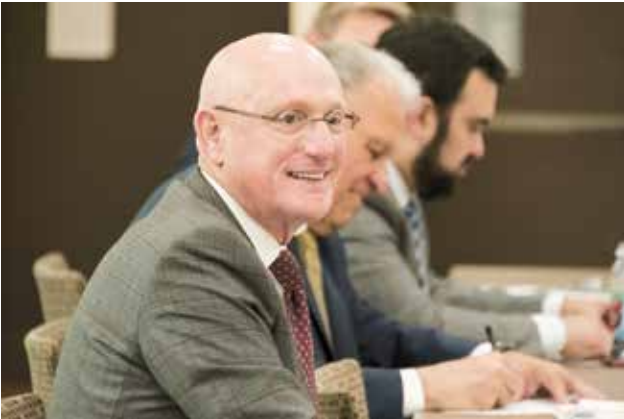
I attended numerous hearings and committee meetings in recent months for the five committees on which I serve.