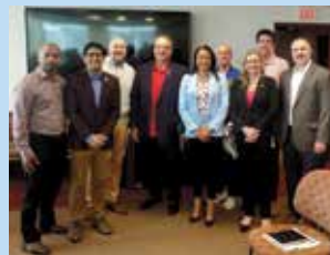
In March, I was glad to meet with the Montgomery County Commissioners and my fellow Montco House Delegation members to discuss how our offices can collaborate and govern effectively.