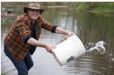
One of my favorite days of the year is Trout Stocking Day with the Fish & Boat Commission!