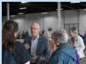
Thank you to all who attended my annual Senior Fair at the Greater Valley Forge Expo Center in Oaks! This year almost 300 attendees received information on services and programs in our region.