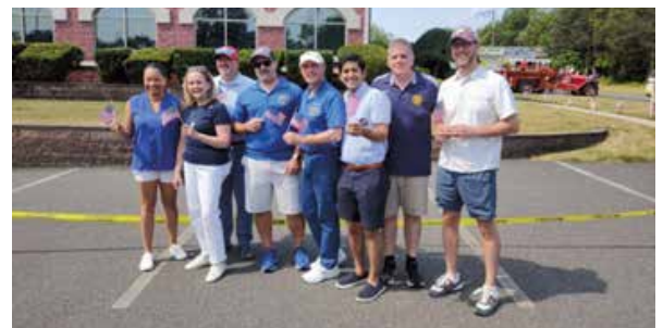
Thank you, neighboring Skippack Township, for including me again this year in your 4th of July parade!