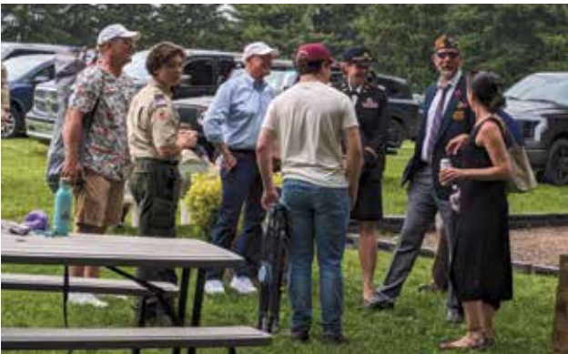
On Memorial Day, I was honored to again be invited to speak at the Trappe-Collegeville Memorial Day Service.