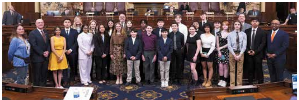
On April 8th, the House welcomed the award-winning Norristown Robotics Team to Harrisburg.