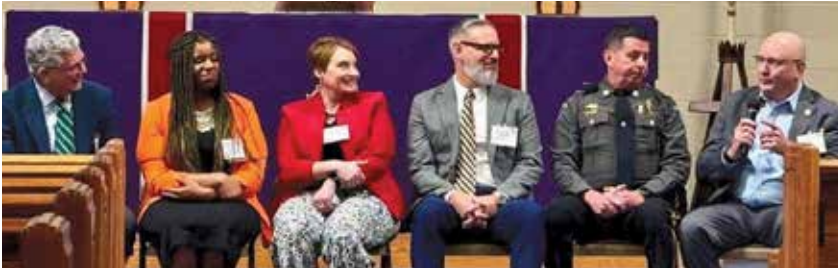
Whether I'm here in the district, Harrisburg, or DC, I'm always willing to have tough conversations on gun violence. Earlier this year I was honored to participate in Upper Dublin Lutheran Church and Or Hadash's Interfaith Gun Violence Prevention Forum.