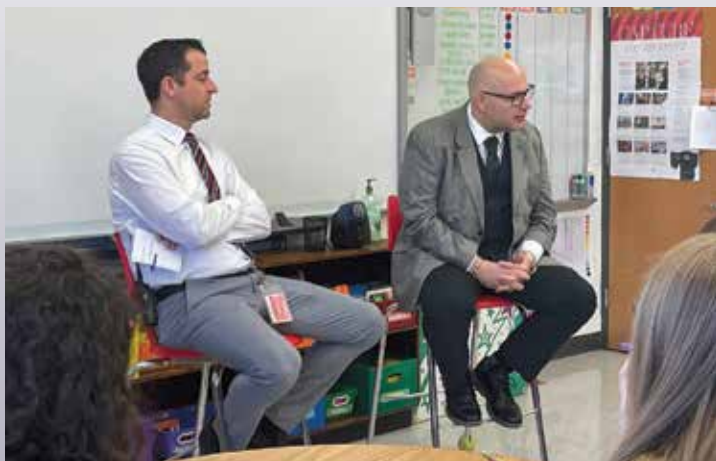
Visiting Freedom Middle School for a Q&A provided a chance to catch up with talented educators and inquisitive students.