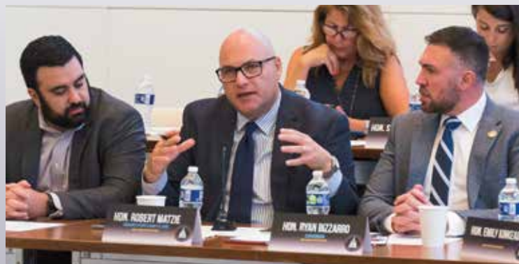
At recent House Policy Committee hearings, we explored innovative new energy technologies, including fusion energy and the creation of a possible hydrogen hub in southwestern PA. Both would create new jobs for the region and address the growing need for energy independence.