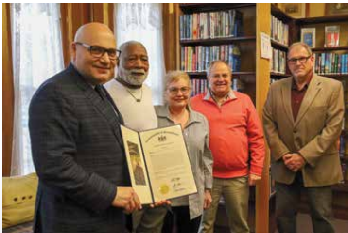
It was a special honor to present a House of Representatives citation to the Rochester Public Library for 100 years of service to the community as a beloved center for learning, storytelling, events and community programs.