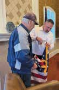
Assembling the new flag set at Harrington Village.