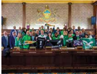
Rooting for the Eagles with some of my colleagues in the PA House.