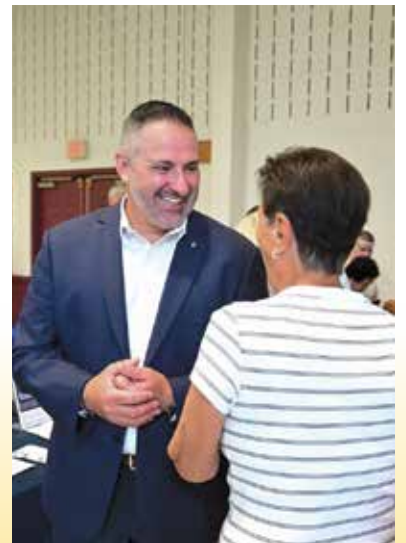
Catching up with residents at my annual senior fair.