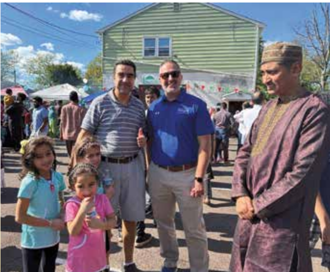
Celebrating Community Day at the Hatfield Jame Masjid.