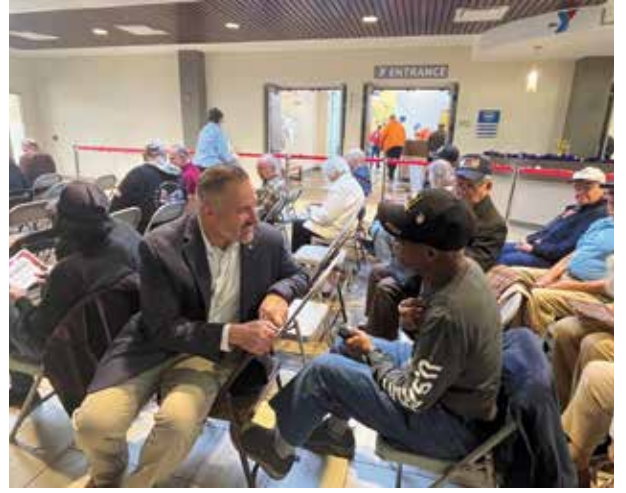
Taking the opportunity to thank veterans for their service.