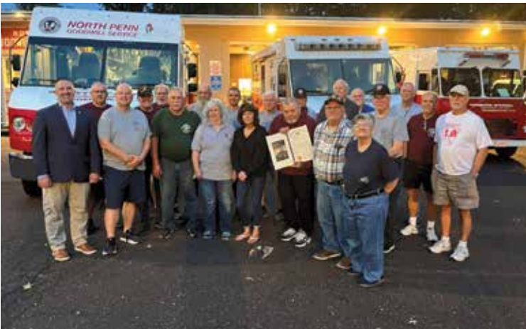
Giving thanks to North Penn Goodwill Service for all they do for our community.