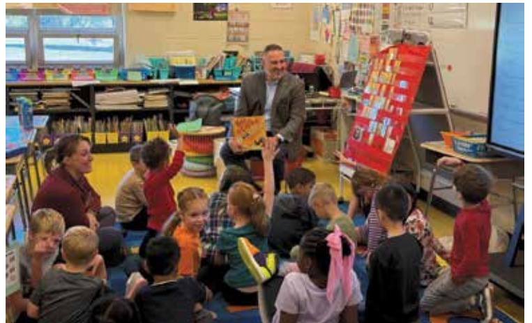
Reading to students at A.M. Kulp Elementary School.