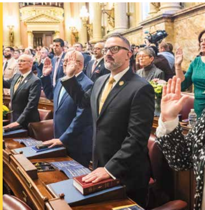
Swearing in for my fourth term as State Representative.

And although 2025 has just started, we've already secured an additional $121,791 for our local police, EMS, and firefighters, as well as $32,400 to help Lansdale restore the Neshaminy Basin Streambank.