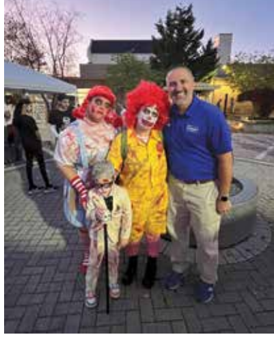
Making new friends at the Lansdale Zombie Walk.