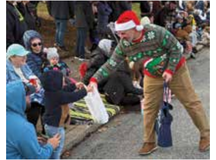
Spreading holiday cheer at the Lansdale Mardi Gras parade.