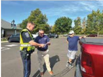
Helping a constituent at our first license plate restoration event.