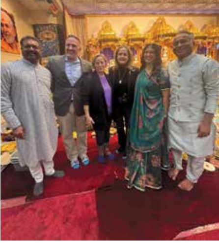
Celebrating Diwali at Bharatiya Temple and Cultural Center.