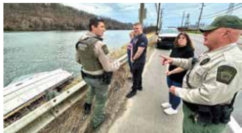
With a Water Conservation Officer and MBA students from Duquesne University to discuss the issue of abandoned boats and possible solutions.

Abandoned boats have become a growing safety and environmental concern. I worked with the Pennsylvania Fish and Boat Commission to get this done and I'm proud that this law will give communities the tools they need to hold boat owners accountable and protect our waterways. Act 28 takes effect in January.