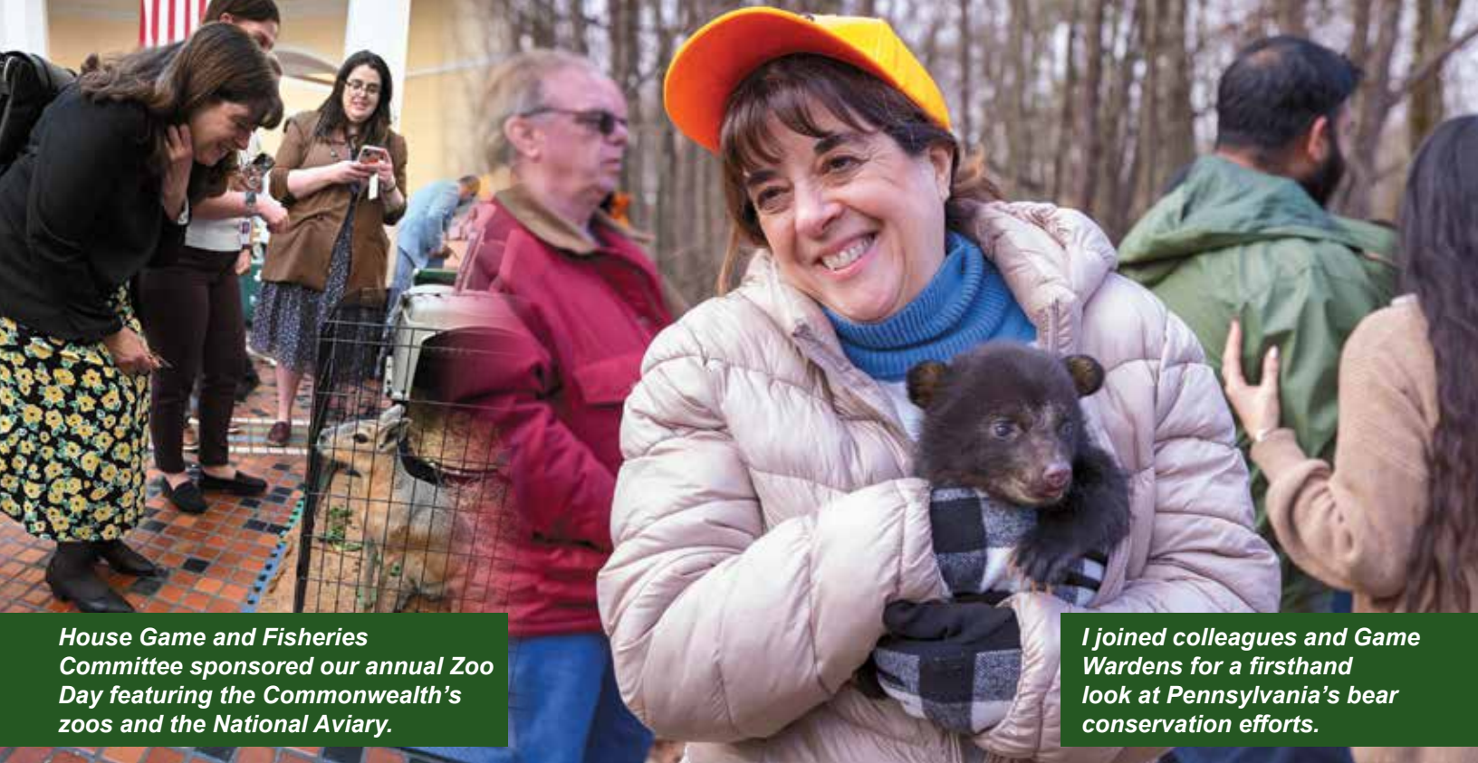
House Game and Fisheries Committee sponsored our annual Zoo Day featuring the Commonwealth's zoos and the National Aviary.