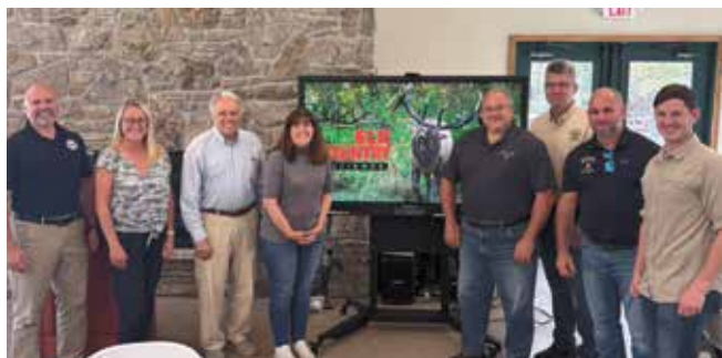
Members of the House Game and Fisheries Committee met with the PA Game Commission and other leaders to discuss updates on the Commonwealth's Elk programs.