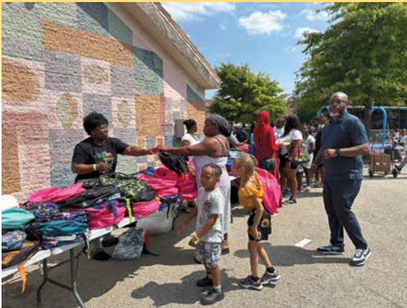
I delivered over 900 backpacks to students to ensure they had a great start to the school year.