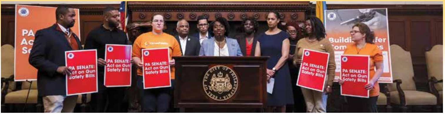
I joined my colleagues at City Hall to urge PA Senate to act on common sense gun safety laws.