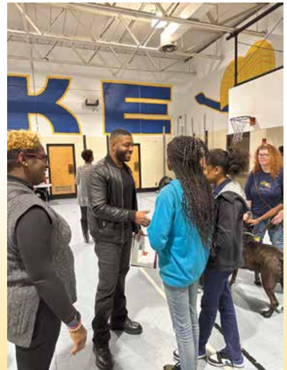
Engaging with local schools is so important; I love hosting events that empower our youth. I toured Alaine Locke School to speak to students and staff about civic engagement.