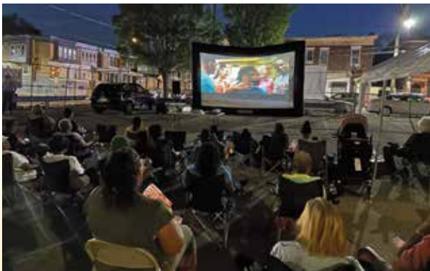
Family movie night in the district is always a great time!