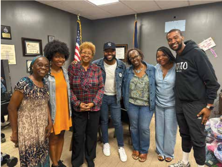
It's important to offer a second chance to formerly incarcerated citizens, and I commend our city organizations that work to help them such as NOMO Foundation, Community Forgiveness and Restoration Initiative.