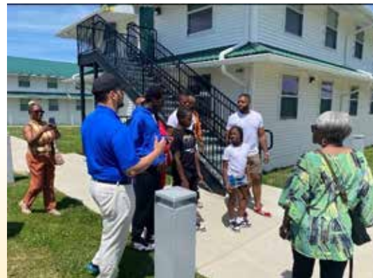
We took several families to visit Keystone State Challenge Academy, a program that gives at risk youth a second chance at life.