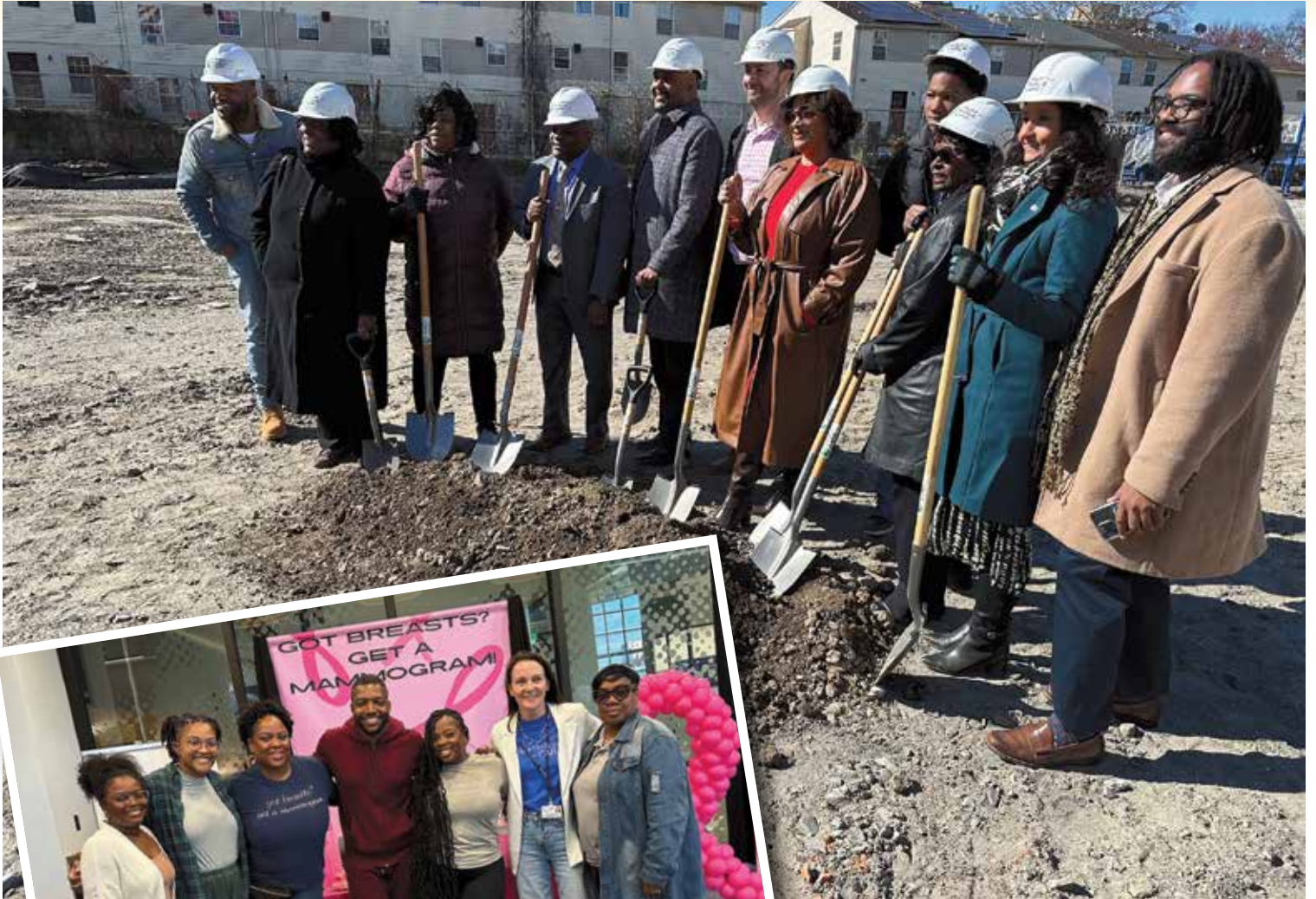
Above: Groundbreaking at Alaine Locke School's new playground.