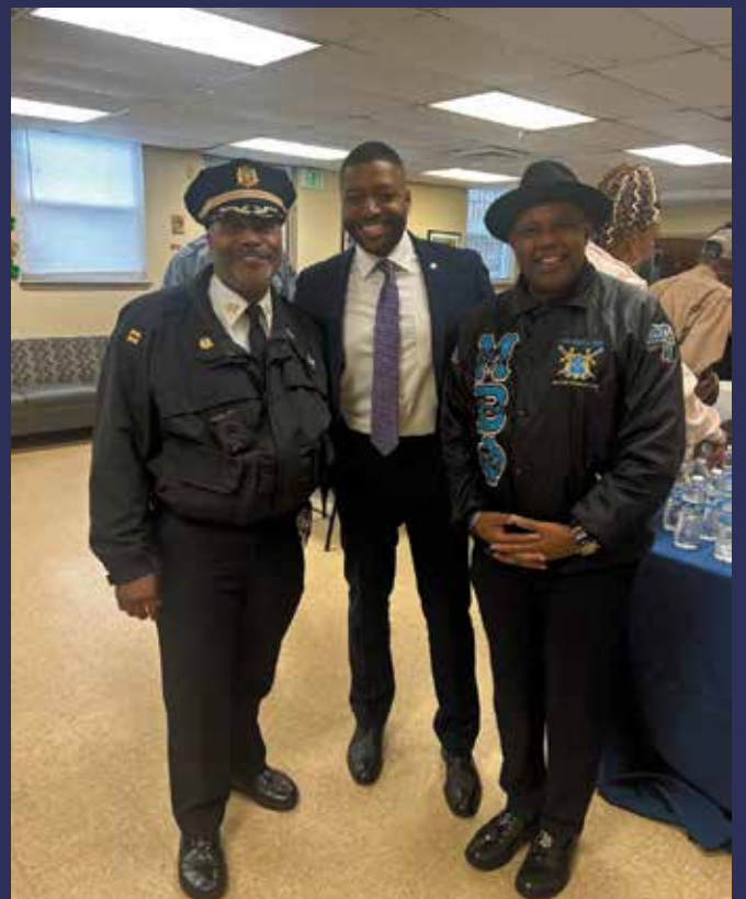
Meeting with police and community members in Logan. We need to work together to stay safe.