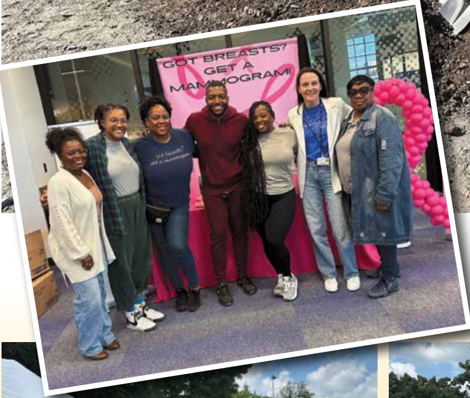
Left: A scene from our health fair.