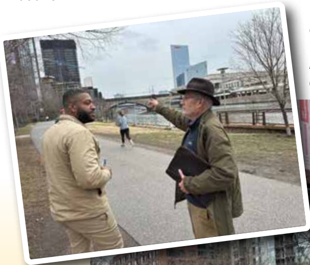
Touring Logan square community, coming up with solutions for blight removal and addressing quality of life issues.