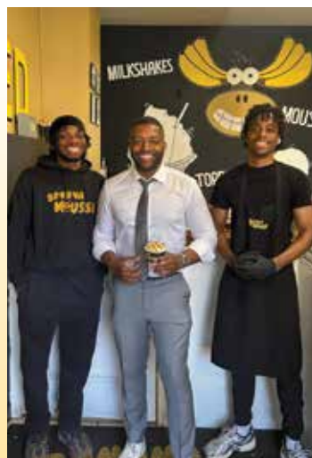
We need to shop small and local. Supporting Black businesses helps our local economy and makes our neighborhoods stronger. Thanks to Banana Mouse and The Grocery Outlet for letting me visit.