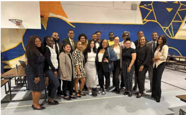
I partnered with the Philadelphia Barristers Association for an Expungement Clinic, because everyone deserves a second chance.