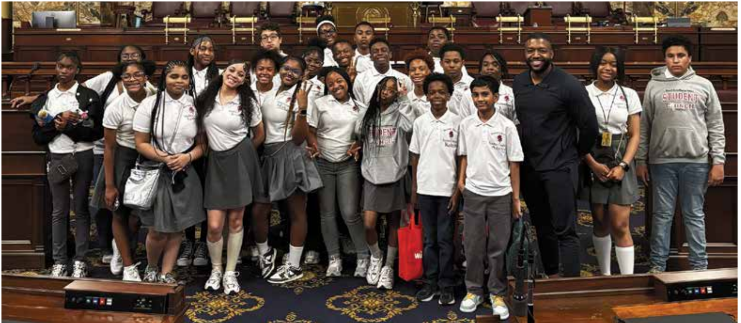
Bringing Philly to Harrisburg – these are students from Russel Byers School in the PA House chamber.