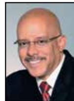
Vincent J. Hughs Senate District 7