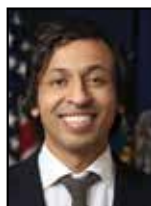
Nikil Saval Senate District 1