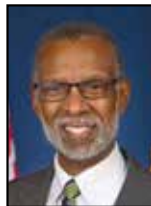
Art Haywood Senate District 4