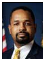
Sharif Street Senate District 3