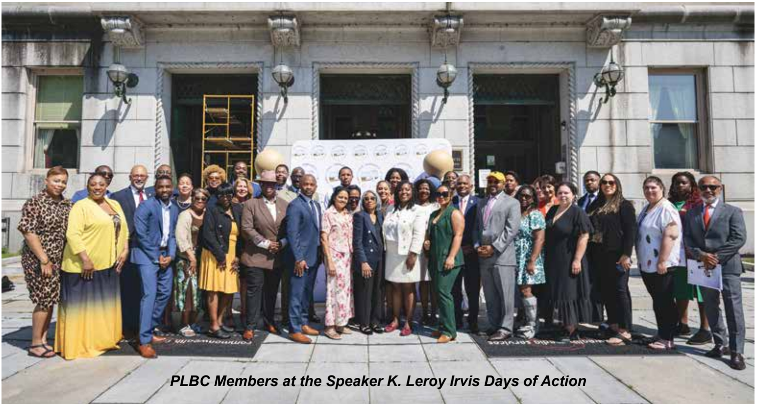
PLBC Members at the Speaker K. Leroy Irvis Days of Action