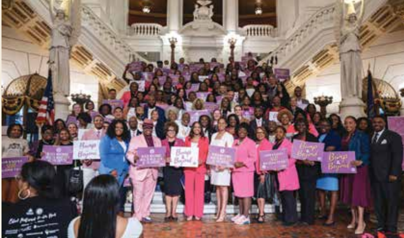
Lt. Governor Austin Davis (D) with the members of PLBC and the Black Maternal Health Caucus during Black Maternal Health Week.

The PA Momnibus is a comprehensive legislative package, crafted for Pennsylvania to directly confront the staggering rate of Black maternal mortality and morbidity in our Commonwealth. The Momnibus addresses critical disparities in maternal healthcare, including measures that would improve access to essential services and eliminate maternal health deserts. The package of legislation would establish programs to tackle social determinants of health and provide essential resources and support to new moms and postpartum people. Together, these proposals represent a significant step toward promoting maternal health equity and ensuring the well-being of all moms and birthing people in Pennsylvania.