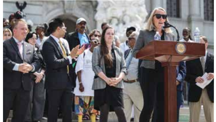
Generating support for banning toxic driveway sealants in Pennsylvania.

With more driveway sealants available that are safer for public health and the environment, we should eliminate the sealants that are toxic.