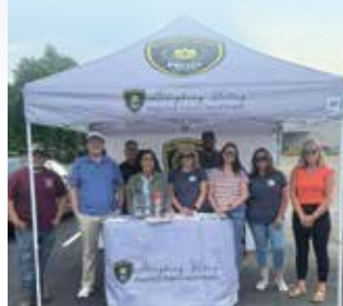
Illegible License Plate Event with Allegheny Valley Regional PD