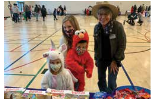
October 29: Fun Halloween party at the Willow Grove YMCA.