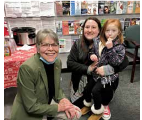
December 3: Meeting constituents at our Open House after the Hatboro Tree Lighting.