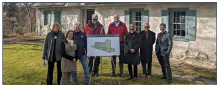
Boileau Farmstead Park – awarding a grant from DCNR.