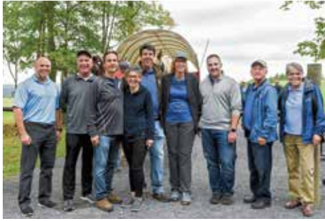
September 16: As a member of the House Game and Fisheries Committee, I had the wonderful opportunity to learn more about Pennsylvania's Elk Tourism in Benezette, PA.