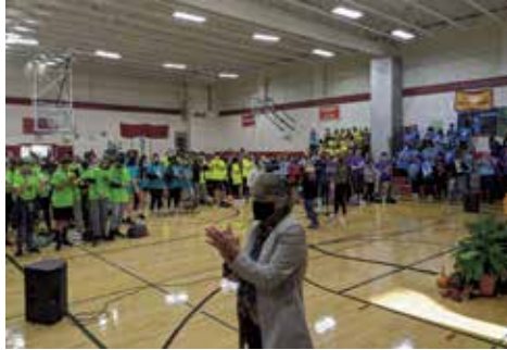
November 1: Keith Valley Middle School in Hatboro-Horsham School District raised over $25,000 for the Make-A-Wish Foundation.