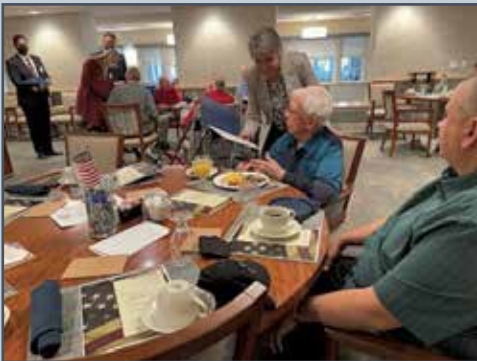
In November, I was honored to be asked to celebrate our veterans at Wesley Enhanced Living's community center and present them with well-earned and deserved citations from Harrisburg.