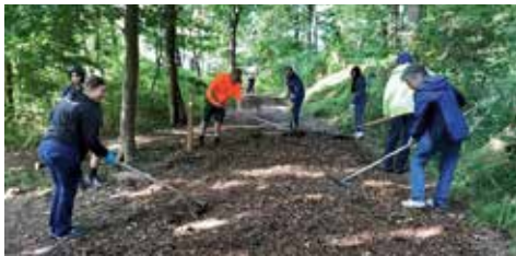
October 2: I enjoyed organizing and participating in this clean-up event with Lower Moreland Township at Valley Center Park.