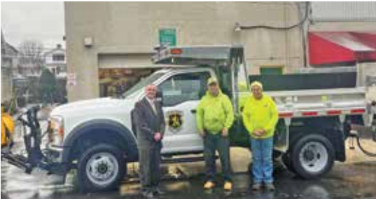
I was invited to check out the new dump truck with the Borough of Heidelberg's Public Works Department, which was purchased with a state grant that I helped to secure.