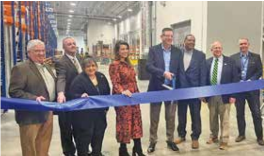
I worked with state Sen. Wayne Fontana to secure $3.5 million in state investments for the revitalization program of the Fairywood neighborhood in the city. We are pictured at the ribbon-cutting ceremony for the project.