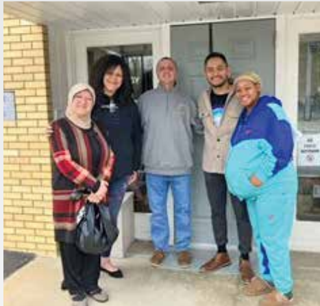
I was happy to meet with home care professionals in my office to discuss a bill that I co-sponsored that would provide for better pay and benefits for this important group of workers.