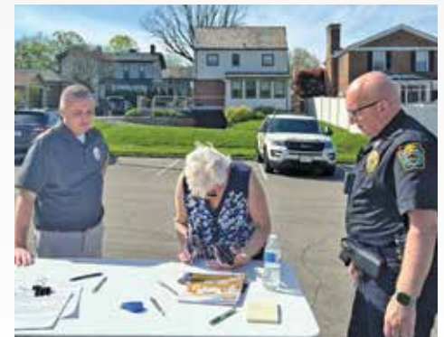
I held a free event with Ingram Police to identify illegible license plates and fill out paperwork for a replacement plate.