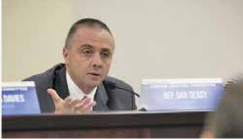
Presiding over a House Liquor Control Committee meeting in Harrisburg.

It's an honor to be the majority chairman of the House Liquor Control Committee. This committee deals with legislation addressing the production and sale of alcohol in Pennsylvania through the Liquor Code. I'd like to highlight some legislation that Gov. Shapiro signed into law that will make a positive impact on the state's alcohol industry: