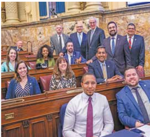
On the PA House floor with many of my colleagues from the Allegheny County House Democratic Delegation.