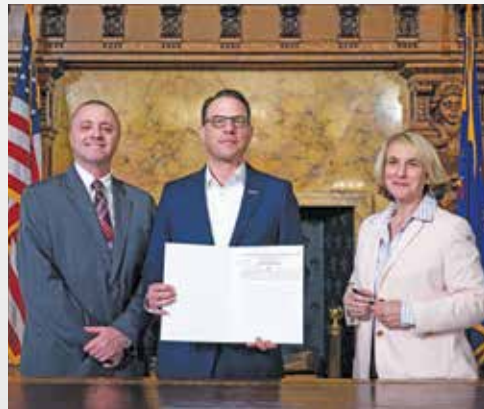
I joined Gov. Shapiro at the ceremonial bill signing of two liquor bills, Act 49 of 2023 and Act 45 of 2023, which will help streamline liquor license approvals, provide businesses with license conversion where needed, classify qualifying businesses as public venues that will support economic development in our communities, and create a task force to look at solutions to problematic liquor business ventures.

House Bill 829 (Act 57 of 2024) marks a significant step toward enhancing the overall hospitality experience. The law provides bars with more flexibility by extending happy hour service from 14 hours per week to 24 hours per week. It also makes permanent the flexible outdoor seating provisions adopted during the COVID-19 pandemic. Additionally, the law establishes a Distilled Spirits Industry Promotion Board to support the growth and potential of the Pennsylvania Distilling Industry.