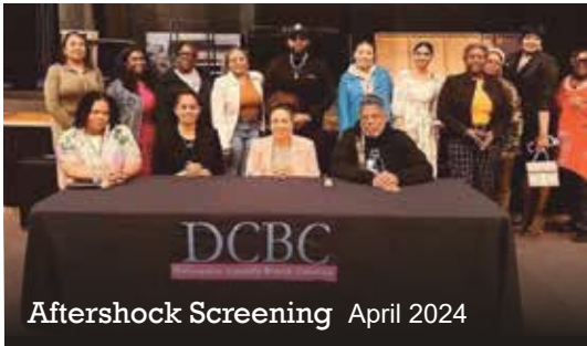
Aftershock Screening April 2024