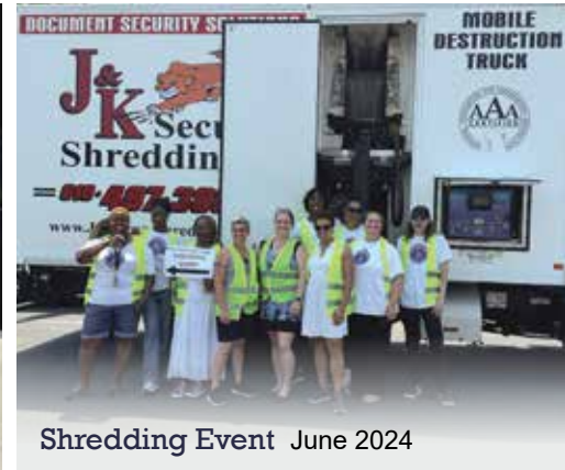
Shredding Event June 2024