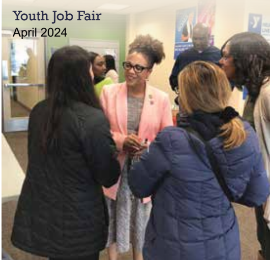
Youth Job Fair April 2024