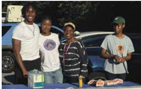
Safety Summit June 2024