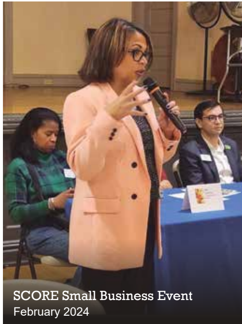
SCORE Small Business Event February 2024