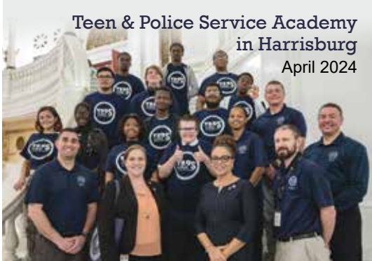
Teen & Police Service Academy in Harrisburg April 2024