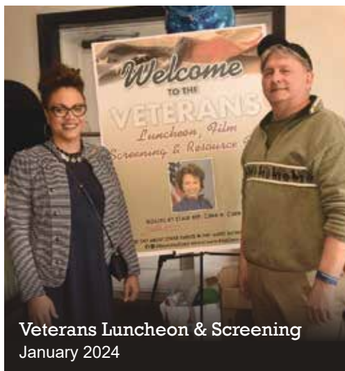
Veterans Luncheon & Screening January 2024