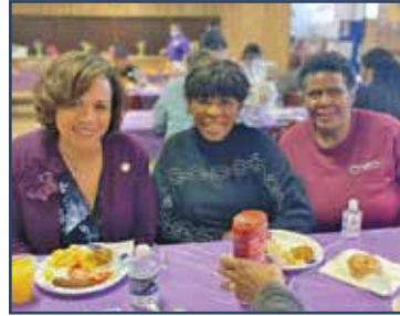
Senior Sunrise Breakfast at St. Paul Evangelical Lutheran Church in Lansdowne.