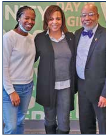
Thank you to everyone who came out to our first in-person Youth Job Fair Event at Lansdowne YMCA in April.