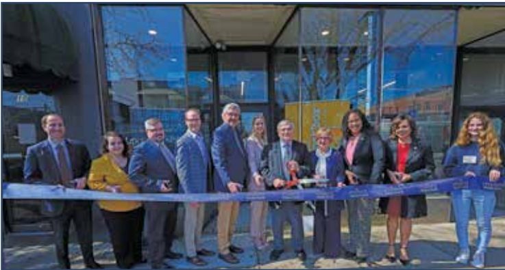
Ribbon cutting for Penn State Brandywine's new LaunchBox in Lansdowne.