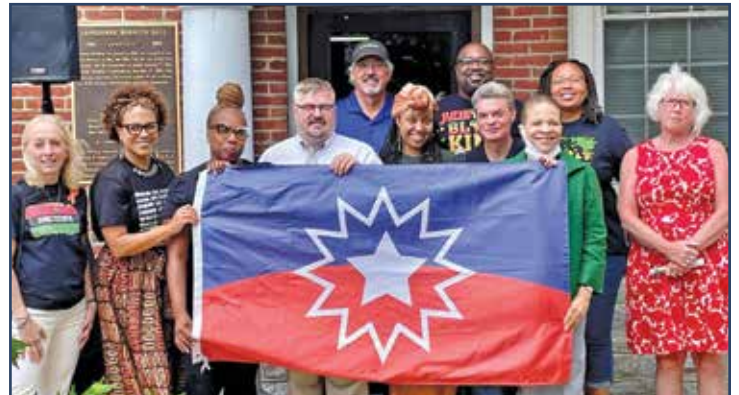
Juneteenth flag-raising ceremony and community celebration in Lansdowne.