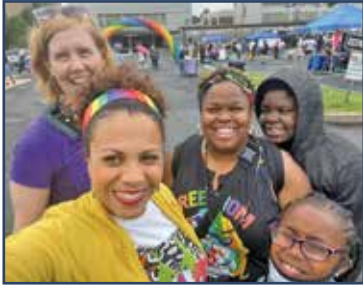
Second annual Pride festival in Upper Darby.