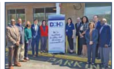
Opening of the Delaware County Health Department Wellness Center in Yeadon.