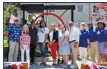
4th of July parade in East Lansdowne Borough.