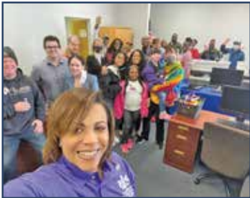
Our first open house in April! It was a pleasure to get to meet you and discuss the services our office offers!