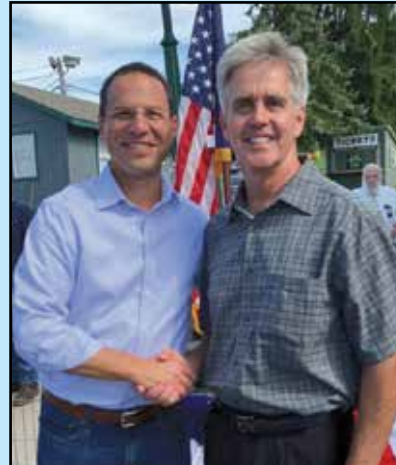
Great to have state Attorney General Josh Shapiro at the Constitution Day celebration at Tussey Mountain in Boalsburg!

I'm always proud to attend the annual Penn State Ag Progress Days, the state's largest outdoor agricultural exhibition, which showcases the latest technology, research exhibits and educational programs in our state's agriculture industry.