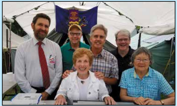
Always a fun time at the Grange Fair!