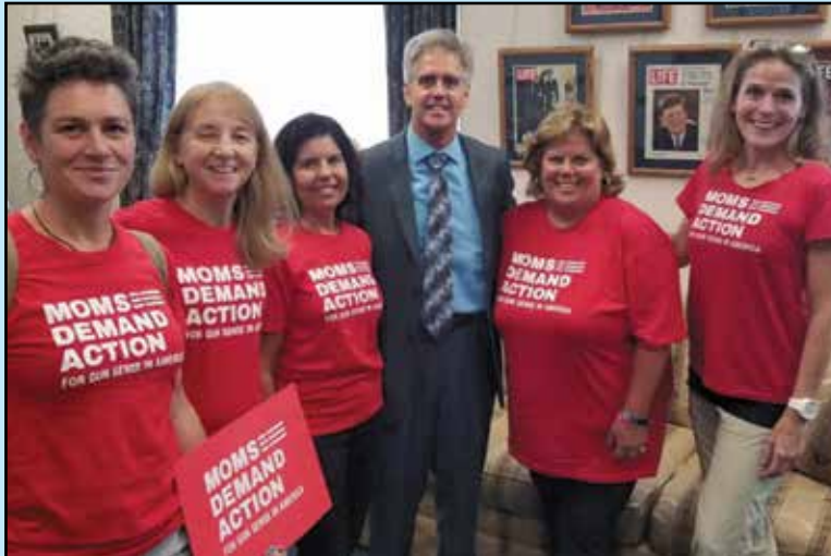
Honored to meet with members of the Moms Demand Action organization!