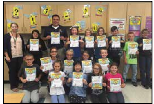
Portage Elementary School