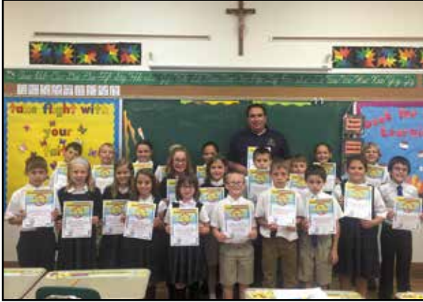
St. Benedict School, third and fourth grade