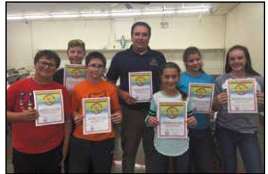
St. Michael's School, seventh grade