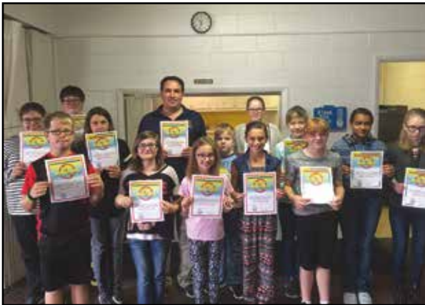
Cambria Christian School

The "Rep. Frank Burns Anti-Bullying Pledge" reminds students that bullying takes many forms, including testing, name-calling, making threats, spreading rumors, purposely excluding someone, pushing, hitting and kicking.