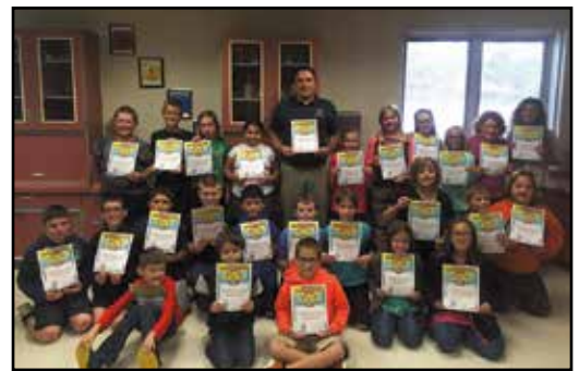
Cambria Heights Elementary School, fifth grade