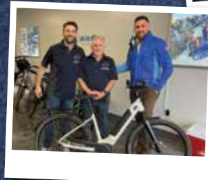
Lake Erie eBikes supports jobs, our health, and the environment.