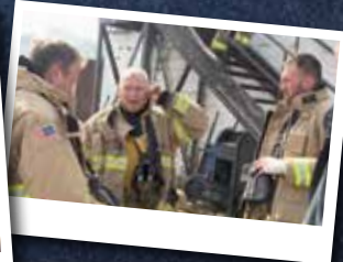
$650,000+ to local fire and EMS companies