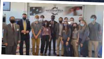
Highlighting how McDowell High School Manufacturing prepares students for local jobs.