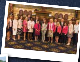
On PA House Floor on Breast Cancer Awareness Day.