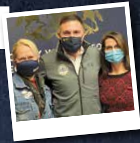
Community Champions working to eliminate preventable Type 2 diabetes.