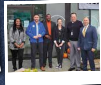
Welcoming Goodblend, a medical marijuana dispensary, to the region.

Need help filling out a grant application for your business or securing proper licensing to do business? Scan this QR code to learn how my office can help.