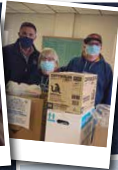
Collecting personal care products for West Millcreek Food Pantry.