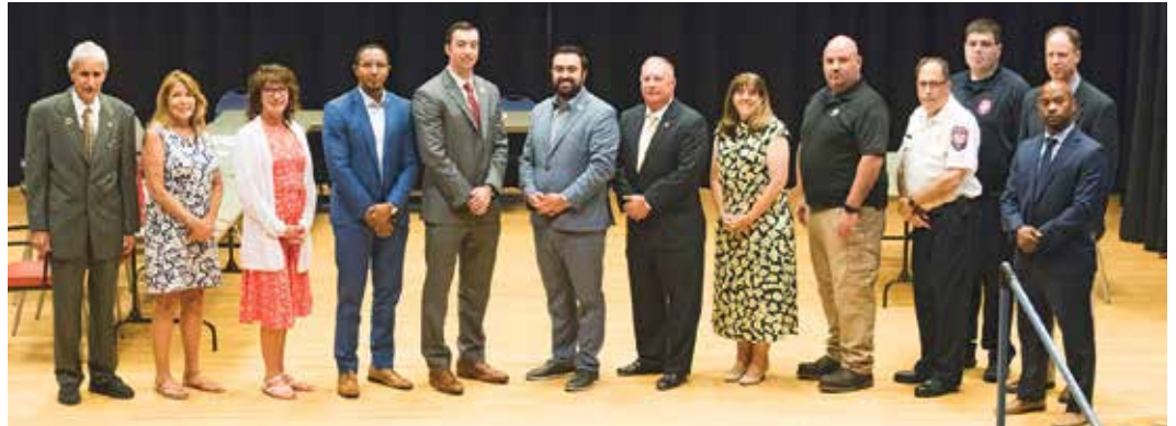
In August, I hosted an informative and productive hearing at CCAC Boyce Campus on my legislation to ease the tax burden on equipment that volunteer firefighters have to purchase themselves. Both statewide leaders and local first responders in my district gave valuable testimony at the hearing.

House Bill 2237 – This bill would provide a cost-of-living adjustment or COLA to retired municipal police officers and firefighters. This proposed COLA would add an additional $480 annually to the pension of an officer with 20 years of experience and 20 years in retirement. The last time the General Assembly provided a COLA to our retired public servants was nearly 20 years ago.