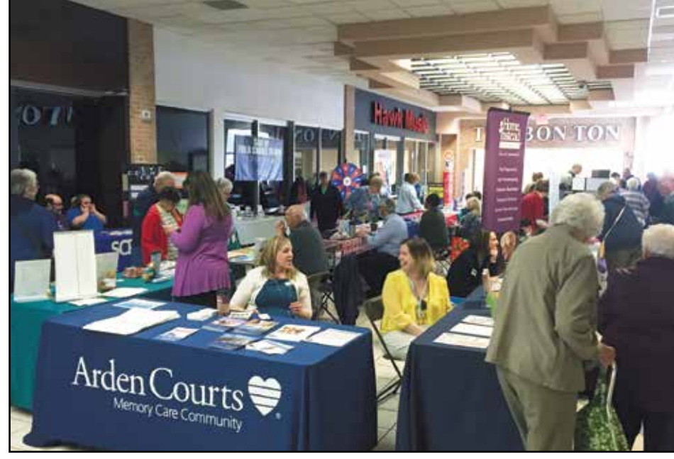
We had a great turnout at my Senior Fair at the Westgate Mall in April. I am looking forward to making next year's event even bigger and better.

To find out if you qualify, or if you need assistance filling out your application, please visit my district office in Whitehall.