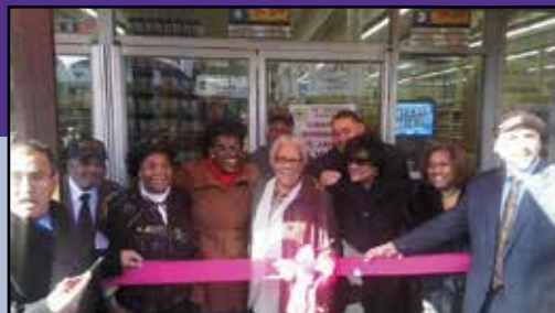
Ribbon-cutting at Sunshine Supermarket at 60th and Ludlow Street.

is much easier for local residents and much more convenient when you can buy all your food and supplies in one location.