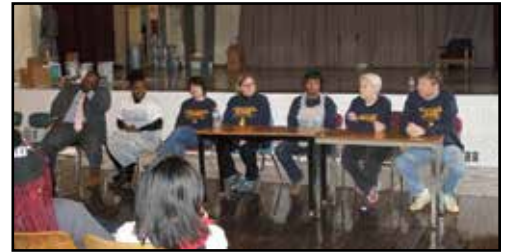
Rep. McClinton during the lunchtime question-and-answer session.