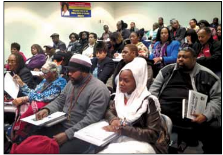
Part of the near-capacity crowd at the small games of chance public meeting.