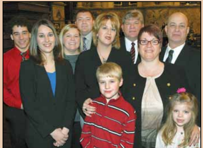
I was all smiles as I took the oath of office on Jan. 1st to represent the 50th Legislative District in the Pennsylvania House of Representatives. At right, my family joins me for the ceremony in the House chamber.